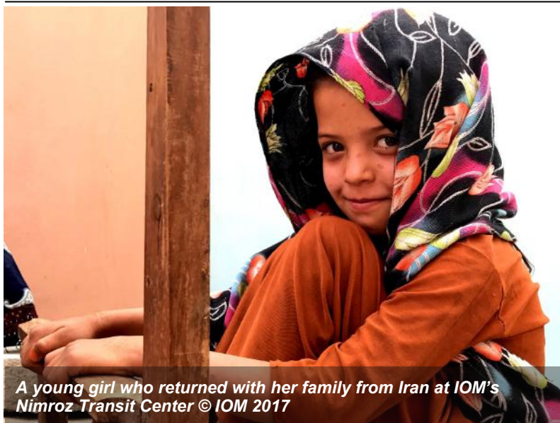
A young girl who returned with her family from Iran at IOM's Nimroz Transit Center