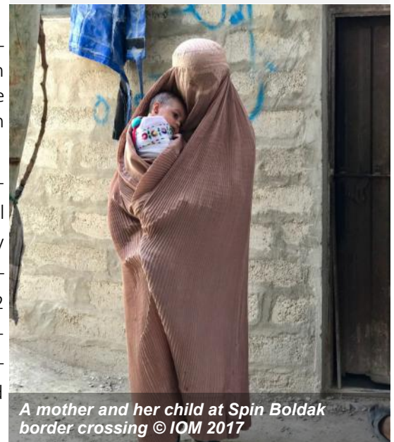
A mother and her child at Spin Boldak border crossing

Of the total returnees, 1,402 were spontaneous returnees and 62 were deported. This number is a 26% decrease compared to the previous week. The total number of undocumented Afghan returnees from Pakistan since 01 January 2017 is now 81,286. IOM provided post-arrival assistance to 94% of undocumented Afghan returnees from Pakistan (1,378 individuals), including 1,182 individuals in poor families, 170 individuals in single parent families and 23 special cases. The assistance provided includes meals, accommodation, basic medical screening, Non-Food Items (NFIs), onward transportation cash grants and referral services, as well as support from partners (see Annex 1).