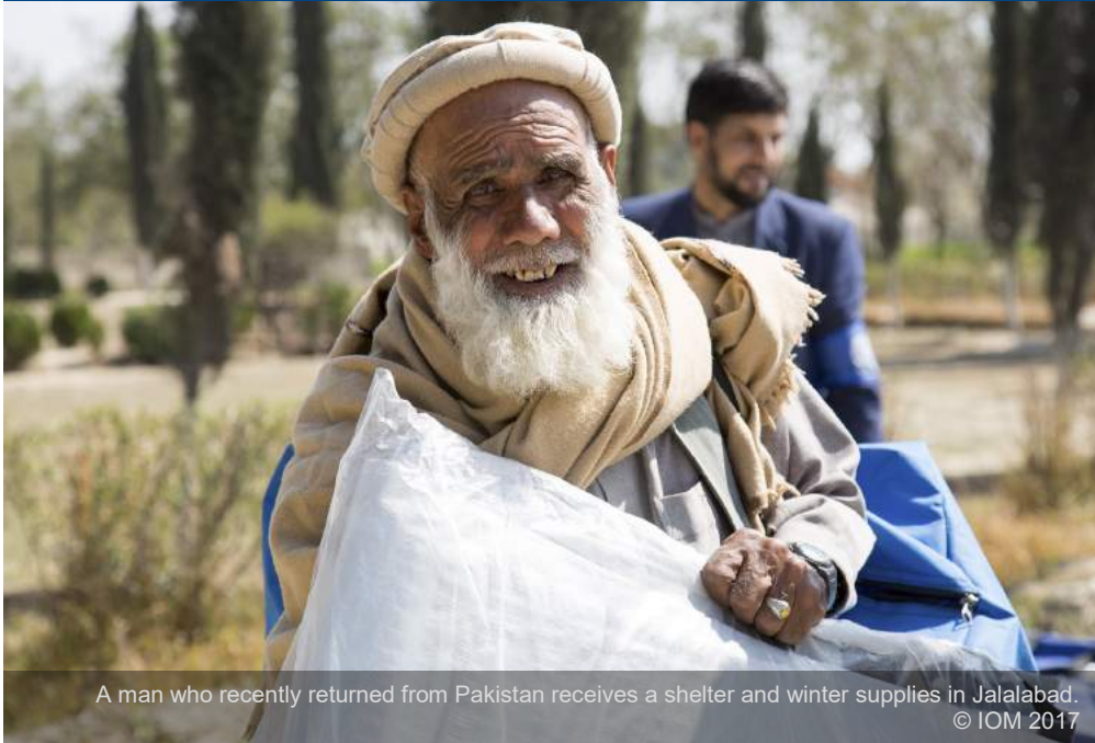
A man who recently returned from Pakistan receives a shelter and winter supplies in Jalalabad.