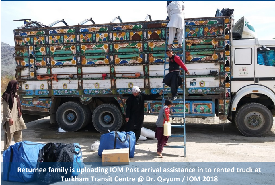
Returnee family is uploading IOM Post arrival assistance in to rented truck at Turkham Transit Centre