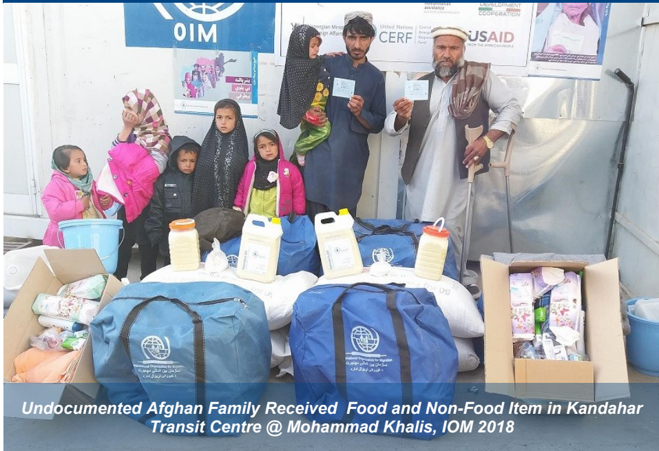
Undocumented Afghan Family Received Food and Non-Food Item in Kandahar Transit Centre @ Mohammad Khalis, IOM 2018