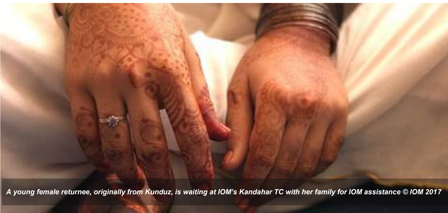
A young female returnee, originally from Kunduz, is waiting at IOM's Kandahar TC with her family for IOM assistance