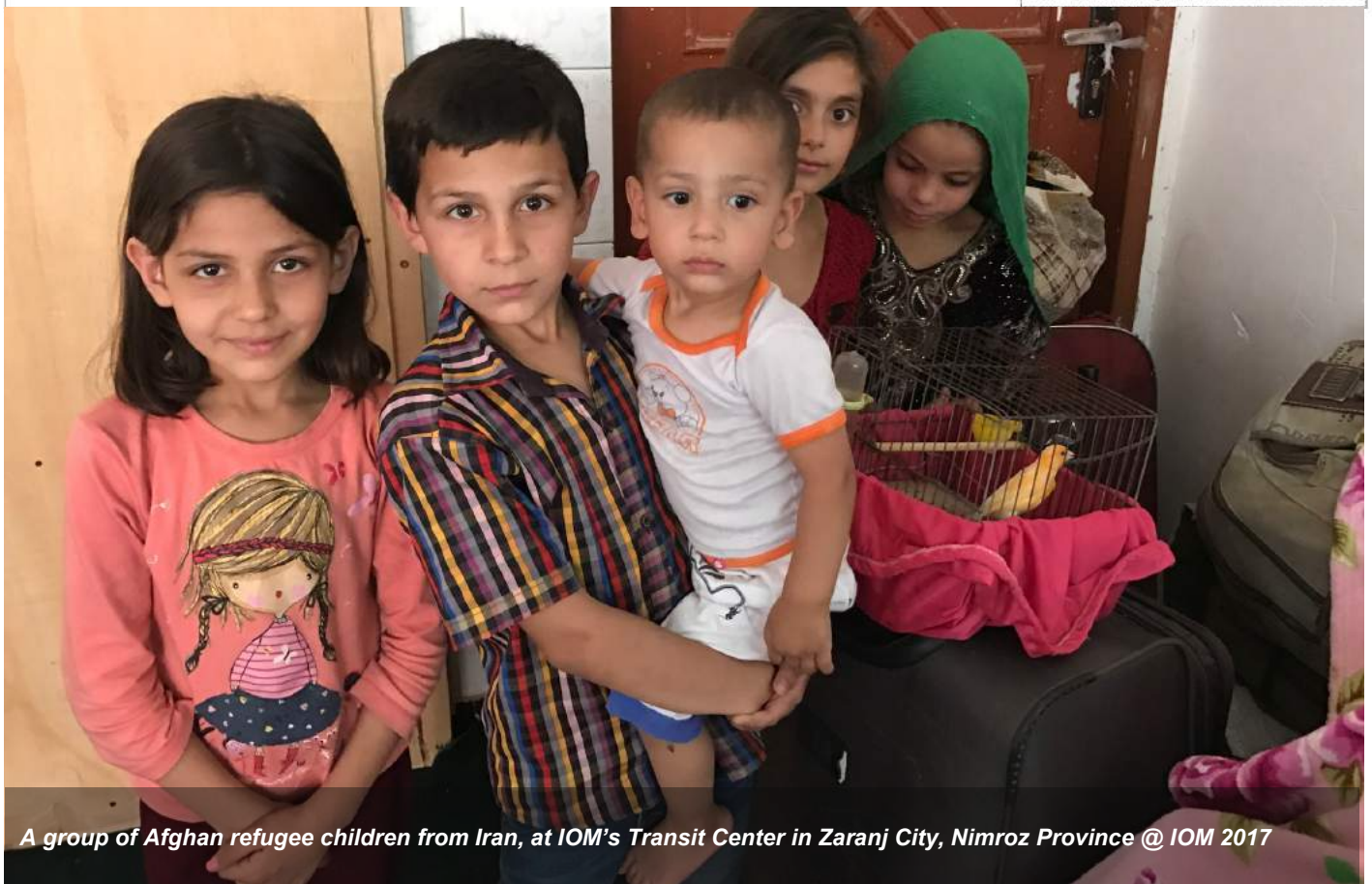
A group of Afghan refugee children from Iran, at IOM's Transit Center in Zaranj City, Nimroz Province

IOM Afghanistan's Returnee Response is generously supported by: