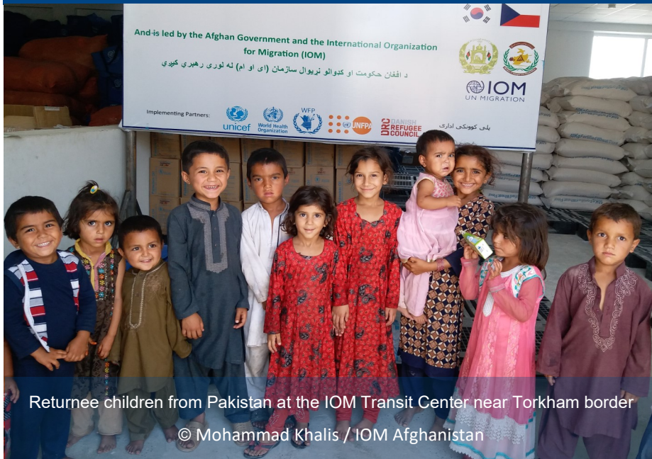
Returnee children from Pakistan at the IOM Transit Center near Torkham border