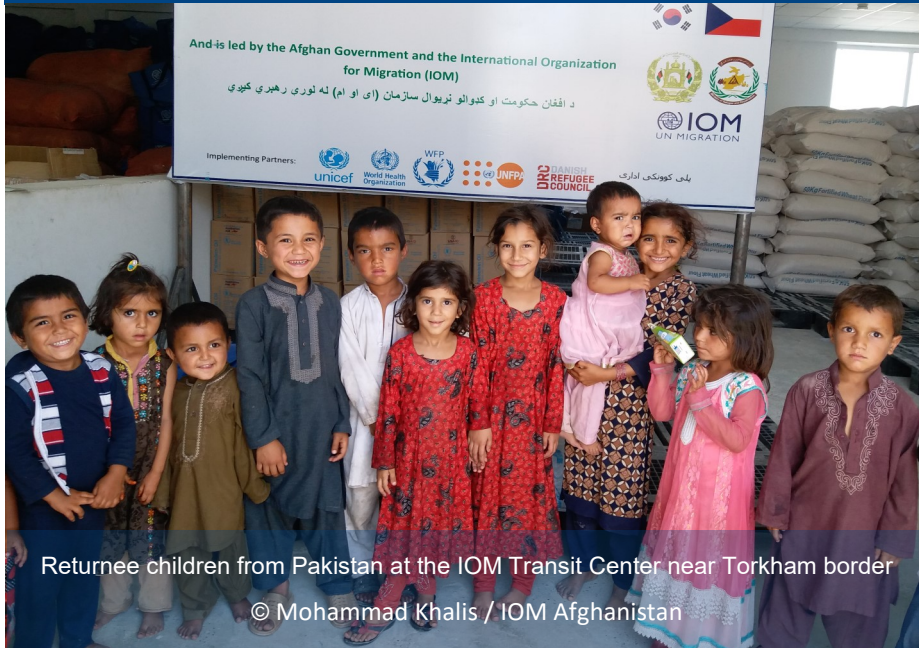
Returnee children from Pakistan at the IOM Transit Center near Torkham border