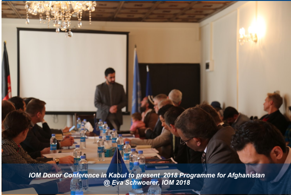
IOM Donor Conference in Kabul to present 2018 Programme for Afghanistan