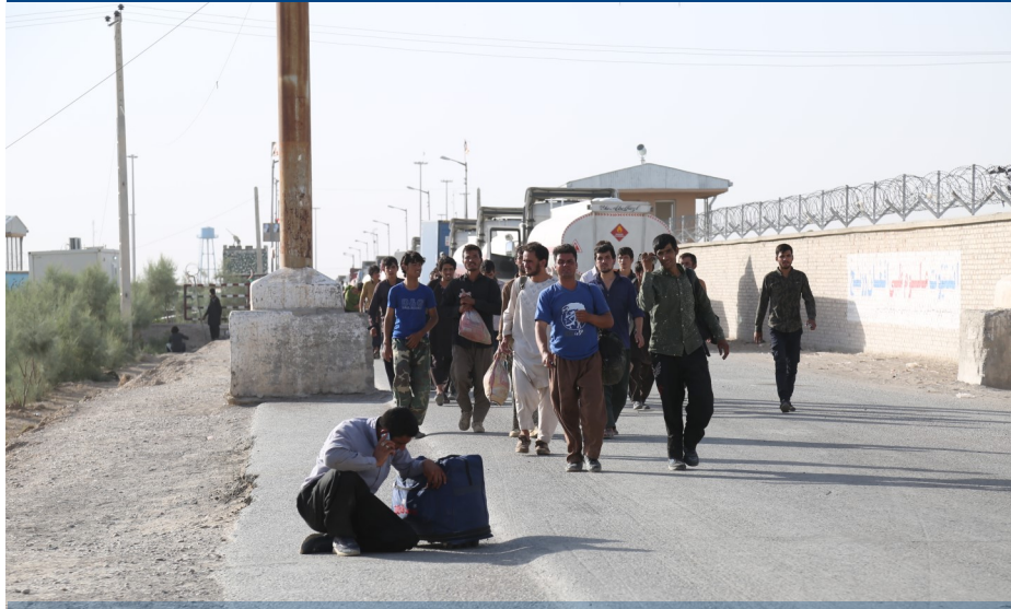
Waves of undocumented Afghan returnees from Iran arriving at the IOM Screening Center on Melak border in Nimroz province