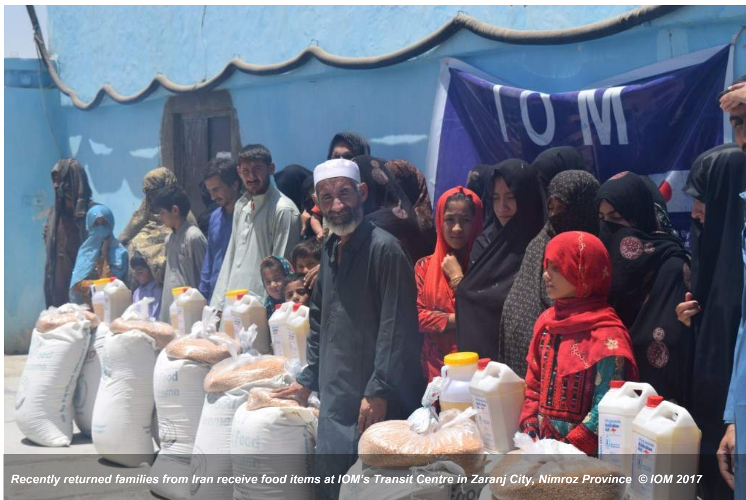
Recently returned families from Iran receive food items at IOM's Transit Centre in Zaranj City, Nimroz Province

IOM Afghanistan's Returnee Response is generously supported by: