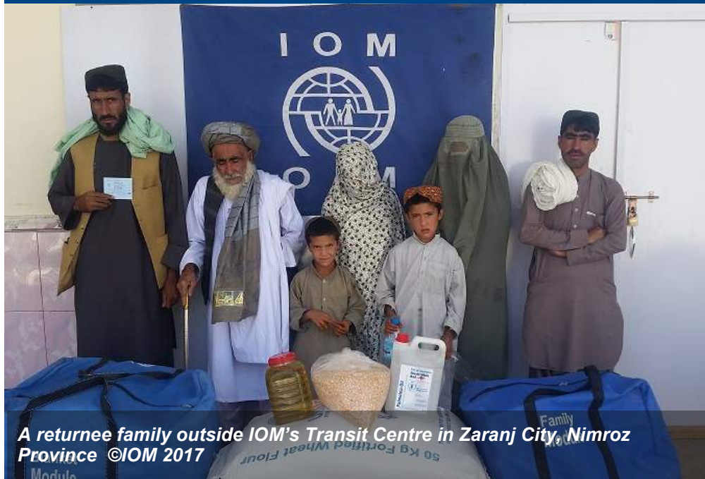
A returnee family outside IOM's Transit Centre in Zaranj City, Nimroz Province