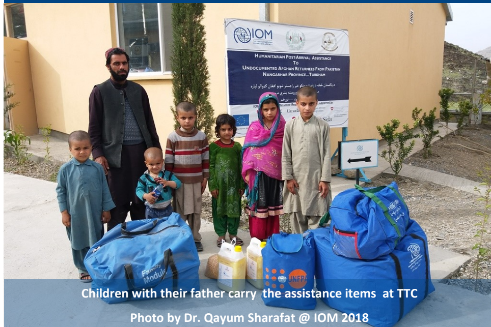
Children with their father carry the assistance items at TTC