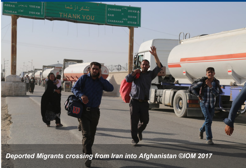
Deported Migrants crossing from Iran into Afghanistan