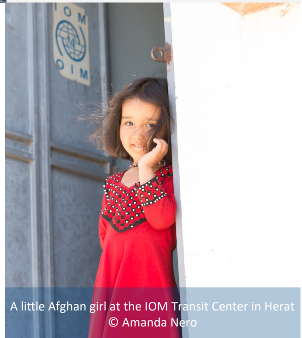
A little Afghan girl at the IOM Transit Center in Herat

Due current funding gaps, IOM was only able to provide post-arrival humanitarian assistance to 62 (1%) undocumented Afghans deported from Iran at its Transit Centers in Nimroz and Herat, including 1 Unaccompanied Migrant Child (UMC), 1 Medical Case (MC), 18 members of Single Parent Families (SP), 1 Single Female (SF), 1 Physical Disabled (PD), 1 Unaccompanied Elderly (UE), 4 Special Cases (SC) and 21 member of Poor Families (PF).