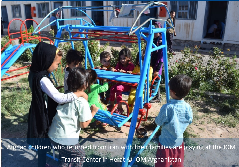
Afghan children who returned from Iran with their families are playing at the IOM Transit Center in Herat