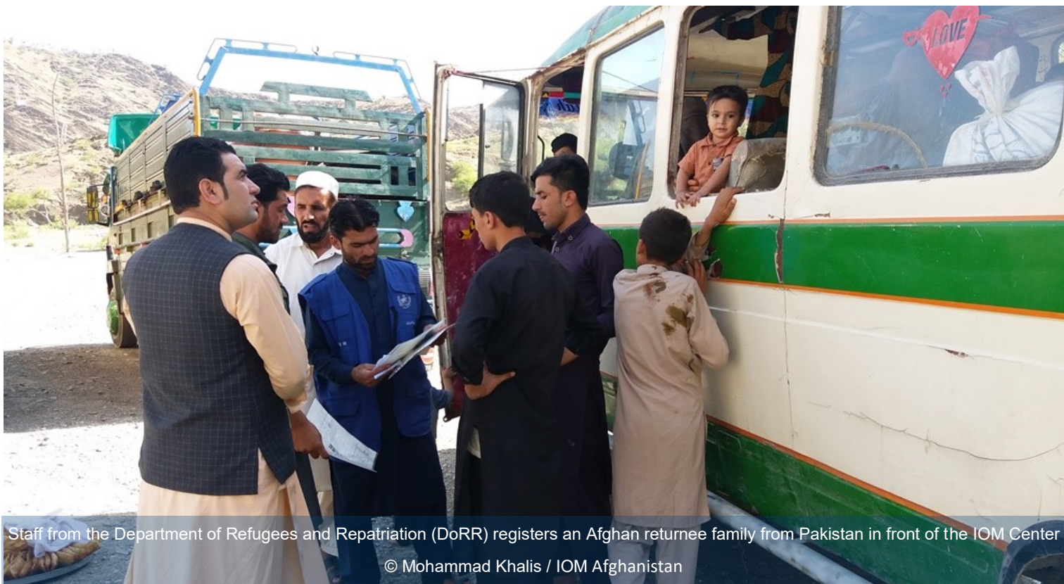
Staff from the Department of Refugees and Repatriation (DoRR) registers an Afghan returnee family from Pakistan in front of the IOM Center

IOM Afghanistan has assisted 29,066 undocumented Afghans returning from Iran and Pakistan since 01 January 2018, thanks to the dedication of our staff and the generosity of our donors.