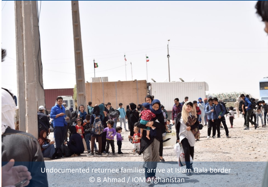
Undocumented returnee families arrive at Islam Qala border