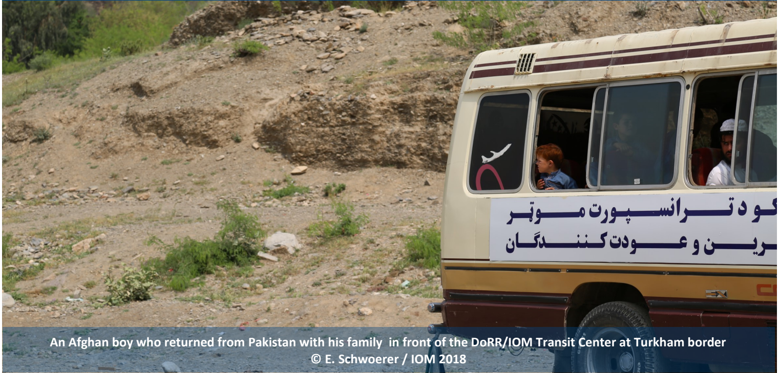
An Afghan boy who returned from Pakistan with his family in front of the DoRR/IOM Transit Center at Turkham border