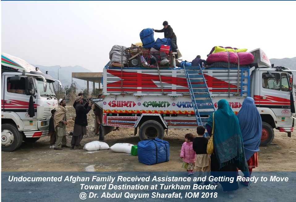
Undocumented Afghan Family Received Assistance and Getting Ready to Move Toward Destination at Turkham Border