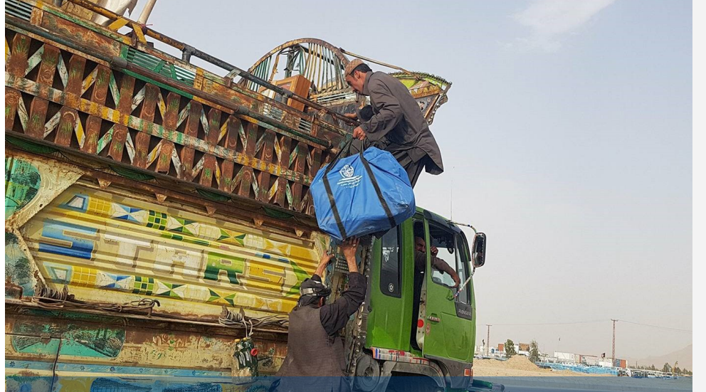
A returnee family from Pakistan loads their assistance onto their truck outside the IOM transit center in Kandahar City