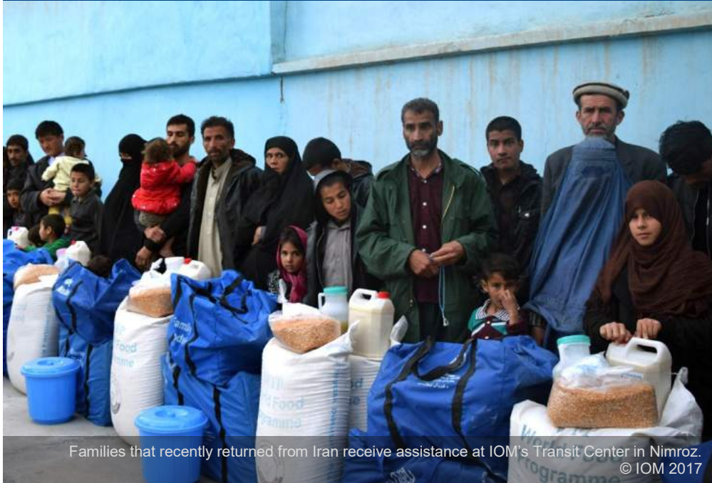
Families that recently returned from Iran receive assistance at IOM's Transit Center in Nimroz.