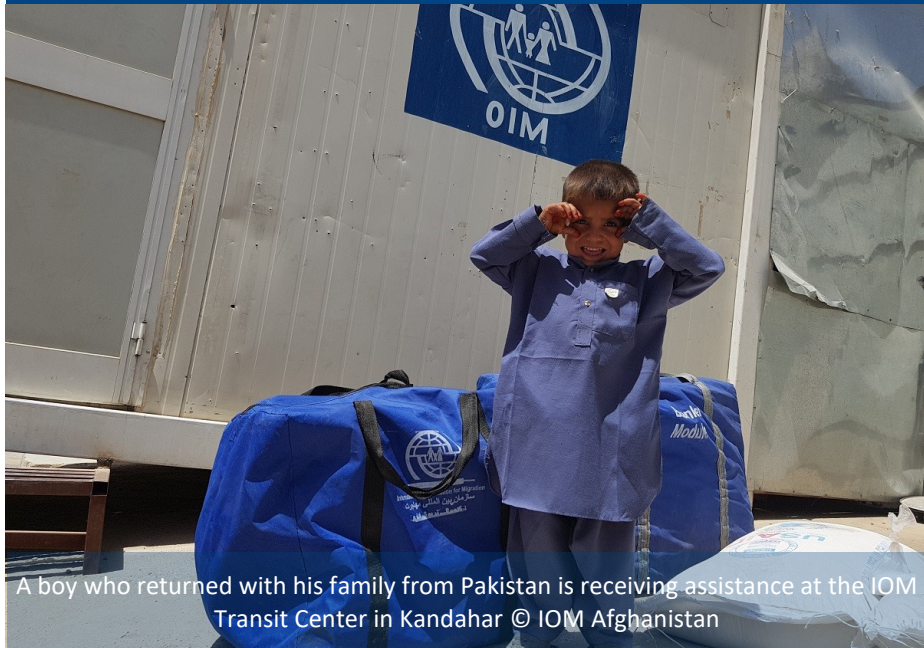
A boy who returned with his family from Pakistan is receiving assistance at the IOM Transit Center in Kandahar