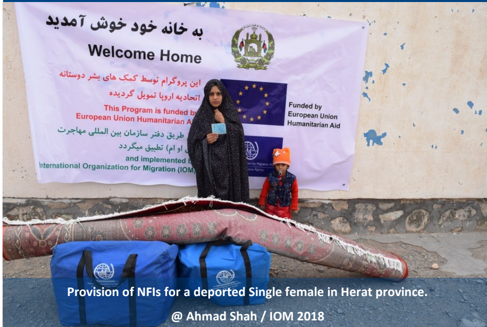
Provision of NFIs for a deported Single female in Herat province.