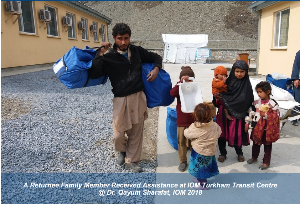
A Returnee Family Member Received Assistance at IOM Turkham Transit Centre