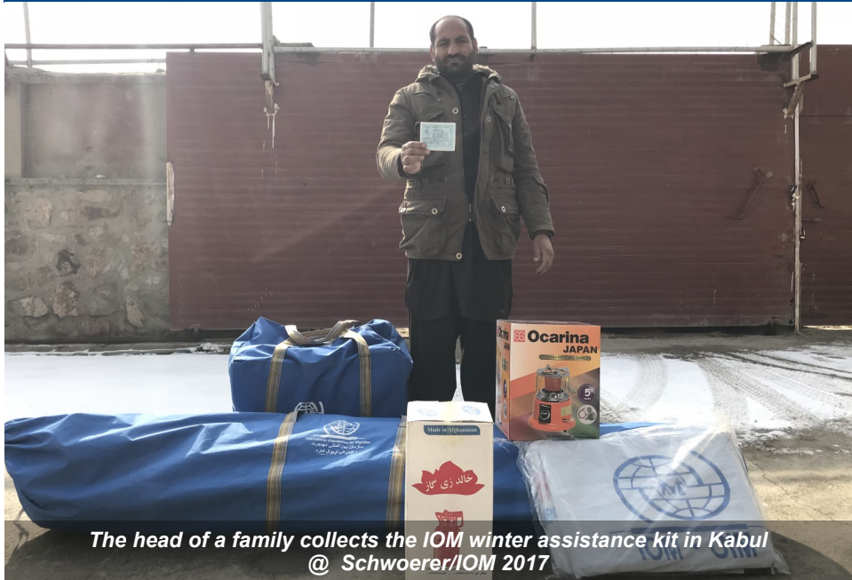
The head of a family collects the IOM winter assistance kit in Kabul