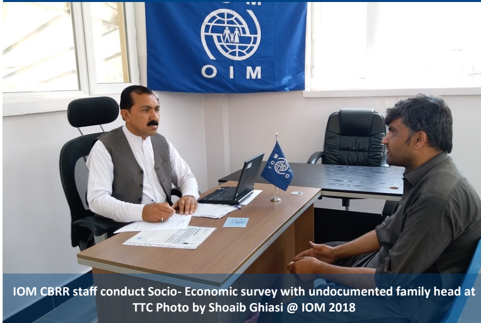
IOM CBRR staff conduct Socio- Economic survey with undocumented family head at TTC