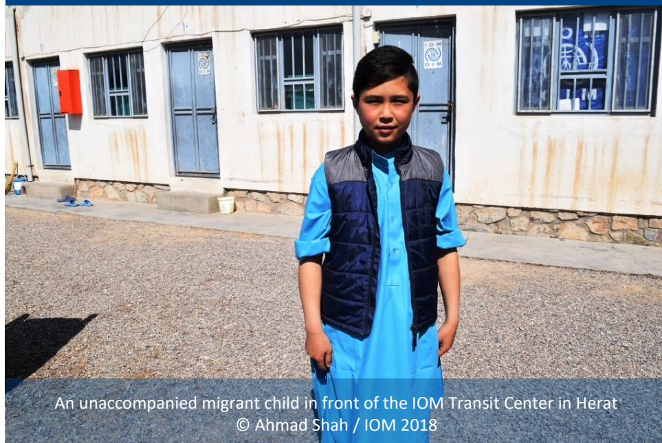
An unaccompanied migrant child in front of the IOM Transit Center in Herat