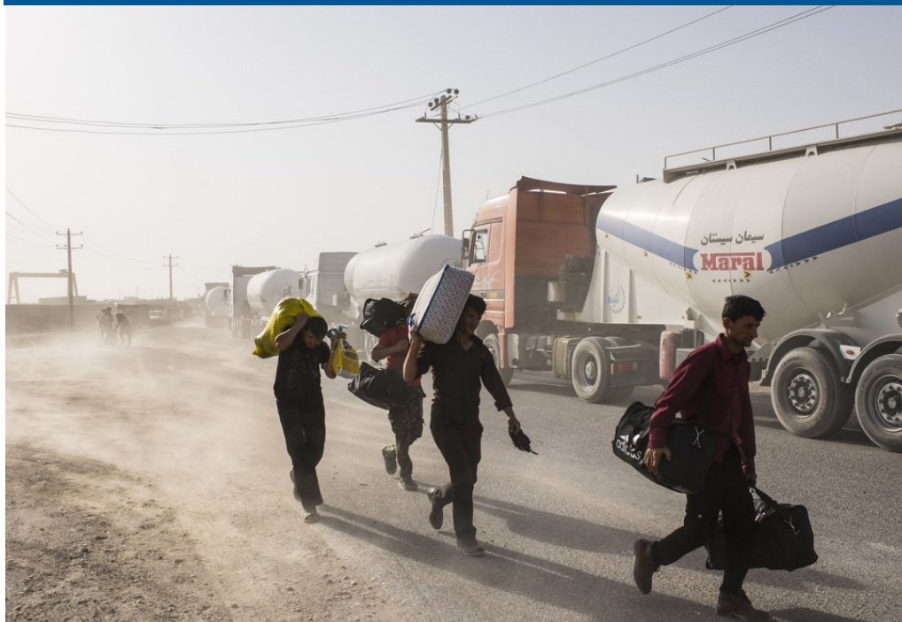
Afghans returning from Iran crossing Melak border in Nimroz province.