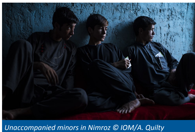
Unaccompanied minors in Nimroz

as a result of Ramadan. The fall in return figures is a reflection of the ongoing political transition in Pakistan. Presently a caretaker government is in place until 25 July when new federal elections will be held. The result of these elections could have major implications for Afghans living in Pakistan.