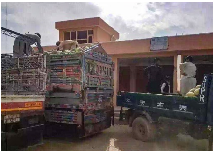
Distribution center in Kabul

From 7 to 13 October, MHPSS awareness campaigns were ongoing in Balkh, Kunar, Laghman and Nangarhar provinces, with 125 Afghan refugees (30 females, 95 male) participating up to date. These campaigns are organized in coordination with local organizations and allow community members in these provinces to increase their awareness on mental health psychosocial support services.