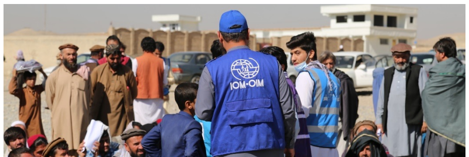
Distribution activities in Kabul