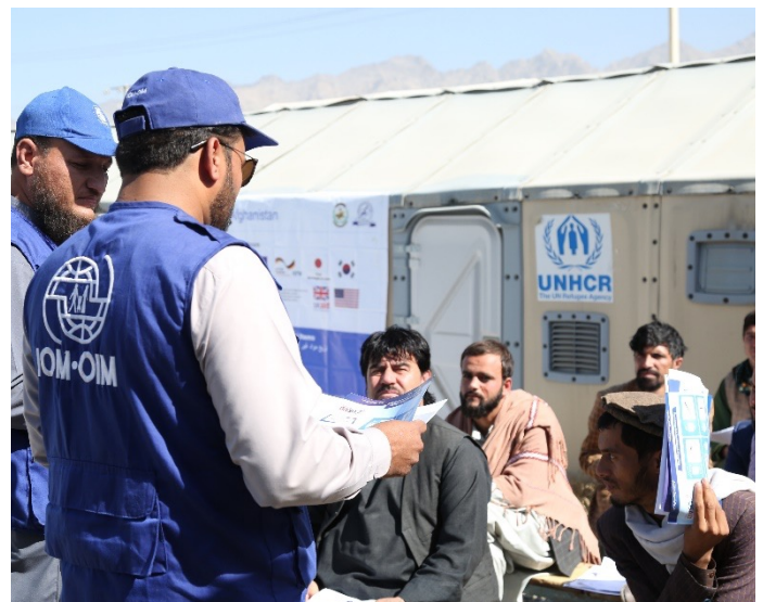
Briefing during distribution activity in Kabul

27,042 undocumented Afghans arrived in Afghanistan from Iran and Pakistan this week (cumulative total from 1 Jan - 13 Oct: 986,337 undocumented)