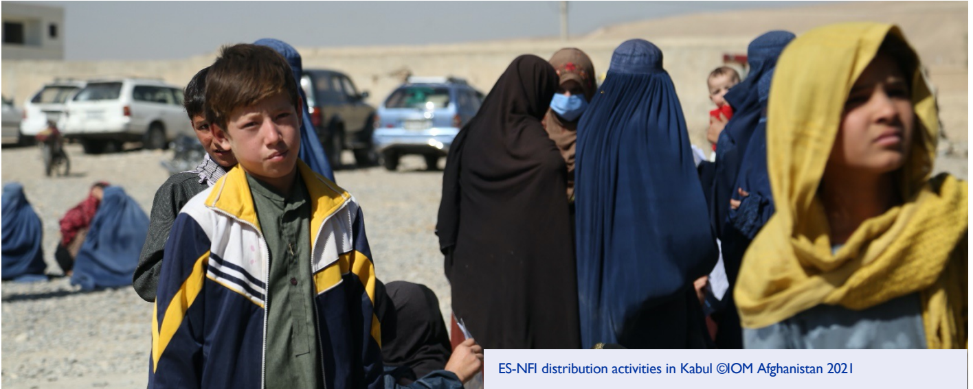
ES-NFI distribution activities in Kabul