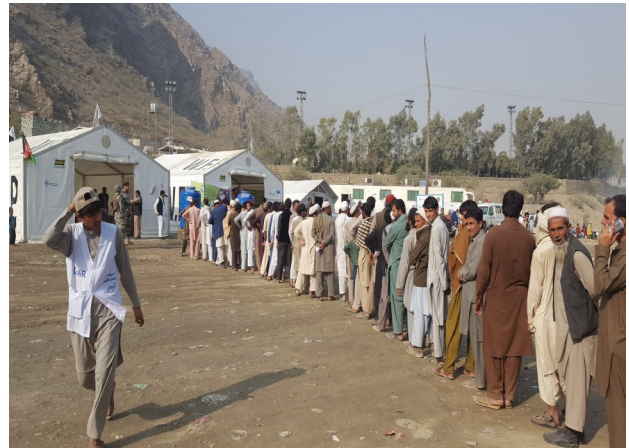
Afghan Returnees queuing to be registered at the Torkham border crossing on 05 November 2016.

IOM provided post-arrival humanitarian assistance to 336 (3.5%) undocumented Afghans through Islam Qala and Milak border crossing points at the IOM transit centers in Herat and Nimroz Provinces. As per the continued observation of the Border Monitoring Team of the DoRR, about 10% of the Undocumented Afghans returning spontaneously or forcefully from Iran are in need of humanitarian assistance, however, because of limited funding IOM was not able to reach this total.