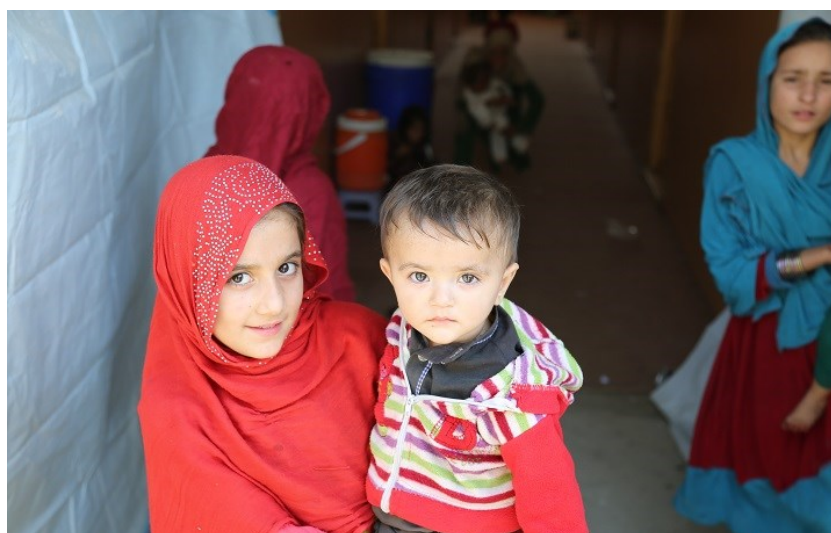
Two Afghan returnee sisters at the IOM Torkham Transit Center on 05 November 2016. In partnership with UNICEF, two child friendly spaces have been established in the accommodation hall for vulnerable families.

IOM Afghanistan's Returnee Response is generously supported by