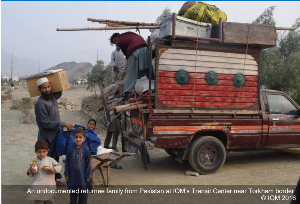
An undocumented returnee family from Pakistan at IOM's Transit Center near Torkham border.