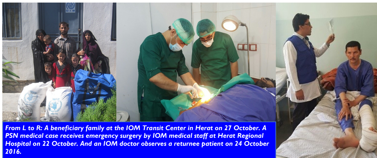
From L to R: A beneficiary family at the IOM Transit Center in Herat on 27 October. A PSN medical case receives emergency surgery by IOM medical staff at Herat Regional Hospital on 22 October. And an IOM doctor observes a returnee patient on 24 October 2016.

IOM Afghanistan's Returnee Response is generously supported by