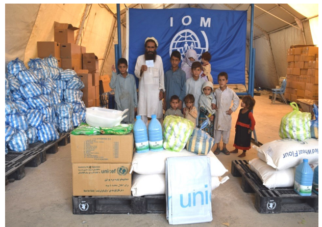
A beneficiary family assisted at IOM's Torkham Transit Center on 24 October 2016.

IOM provided post-arrival humanitarian assistance to 331 (3%) undocumented Afghans through Islam Qala and Milak border crossing points at the IOM transit centers in Herat and Nimroz Provinces. As per the continued observation of the Border Monitoring Team of the DoRR, about 10% of the Undocumented Afghans returning spontaneously or forcefully from Iran are in need of humanitarian assistance, however, because of limited funding IOM was not able to reach this total.