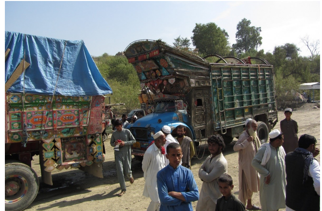
Returnees queue to be registered at the Torkham border crossing on 19 October 2016.

During the past week, IOM assisted 2,743 (32%) undocumented Afghans from the total number of returnees through the Torkham crossing (8,449) with post-arrival humanitarian assistance including meals and accommodation at the IOM Transit Center, NFIs for families, special assistance to Persons with Specific Needs (PSNs), a one-month food ration from WFP and family and hygiene kits from UNICEF.