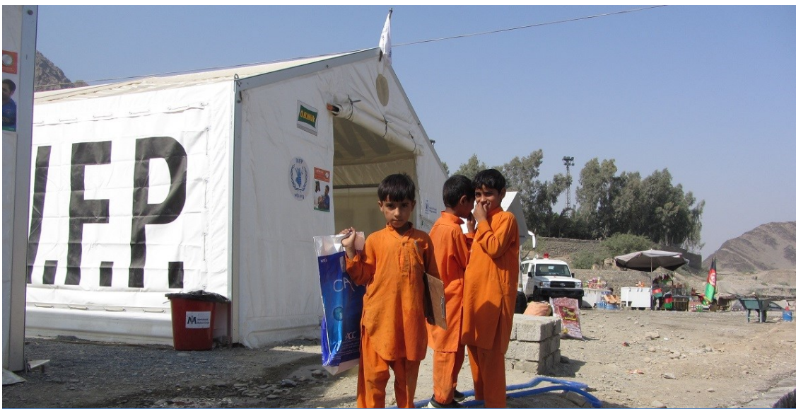
Three returnee brothers await their father outside of newly erected rub halls at the Torkham border crossing on 19 October 2016.

IOM Afghanistan’s Returnee Response is generously supported by