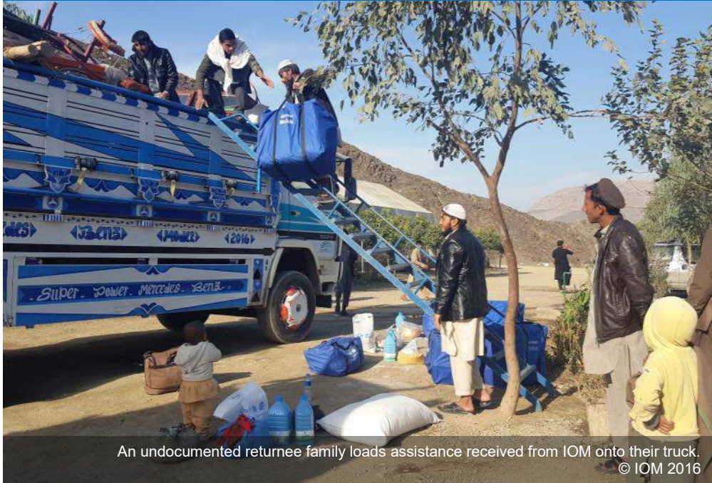
An undocumented returnee family loads assistance received from IOM onto their truck.