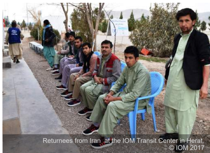
Returnees from Iran at the IOM Transit Center in Herat.

IOM provided post-arrival humanitarian assistance to 199 (2.5%) undocumented Afghans arriving from Iran at its Transit Centers in Herat and Nimroz provinces, including 53 unaccompanied migrant children and 25 individuals with special medical needs. A gap in assistance remains, as DoRR estimates that approximately 10% of undocumented Afghans returning from Iran are in need of humanitarian assistance.