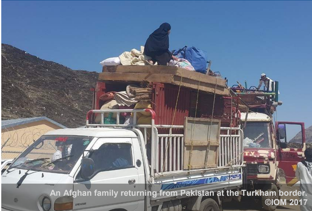
An Afghan family returning from Pakistan at the Turkham border.