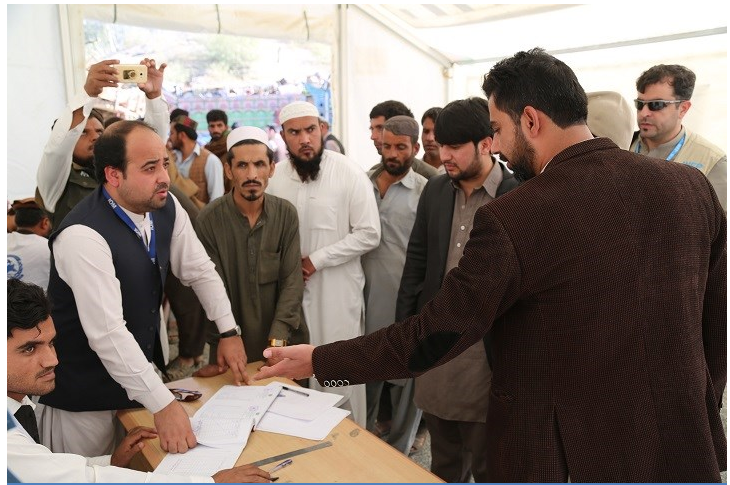
IOM staff working with DoRR at the Torkham border crossing in early November 2016.

IOM provided post-arrival humanitarian assistance to 245 (2.6 %) undocumented Afghans through Islam Qala and Milak border crossing points at the IOM transit centers in Herat and Nimroz Provinces. As per the continued observation of the Border Monitoring Team of the DoRR, about 10% of the Undocumented Afghans returning spontaneously or forcefully from Iran are in need of humanitarian assistance.