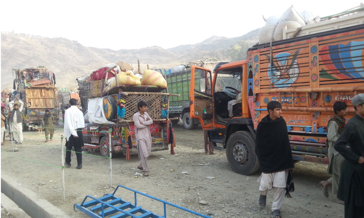
Afghan Returnees waiting for registration at the Torkham Zero Point on 10 November 2016.

The projection changes based on the weekly trends from Pakistan through Torkham and Spin Boldak border crossing points. Based on the trends from 6-12 November 2016 the projection for the remainder of 2016 to 31 December is 89,388 individuals.