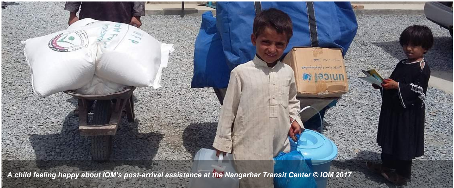
A child feeling happy about IOM's post-arrival assistance at the Nangarhar Transit Center