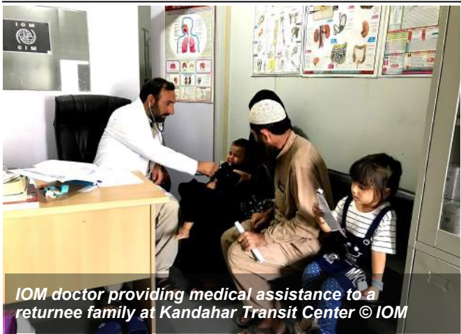
IOM doctor providing medical assistance to a returnee family at Kandahar Transit Center