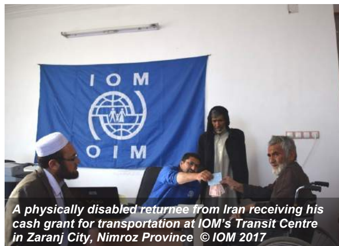
A physically disabled returnee from Iran receiving his cash grant for transportation at IOM's Transit Centre in Zaranj City, Nimroz Province

IOM provided post-arrival humanitarian assistance to 119 (3%) undocumented Afghans deported from Iran at its Transit Centers in Herat and Nimroz, including 15 special cases, 2 medical cases and 34 unaccompanied migrant children.