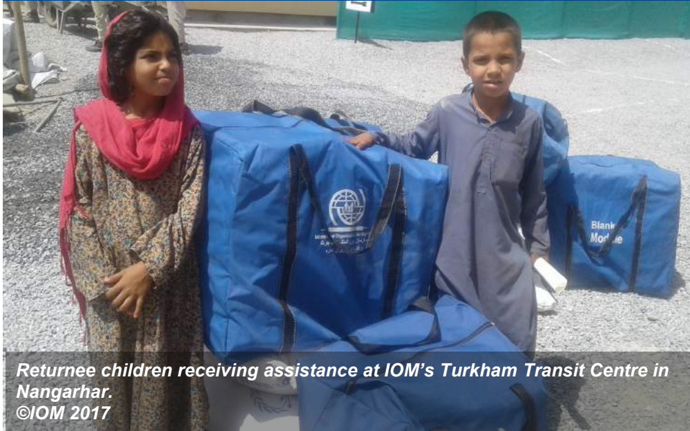
Returnee children receiving assistance at IOM's Turkham Transit Centre in Nangarhar.