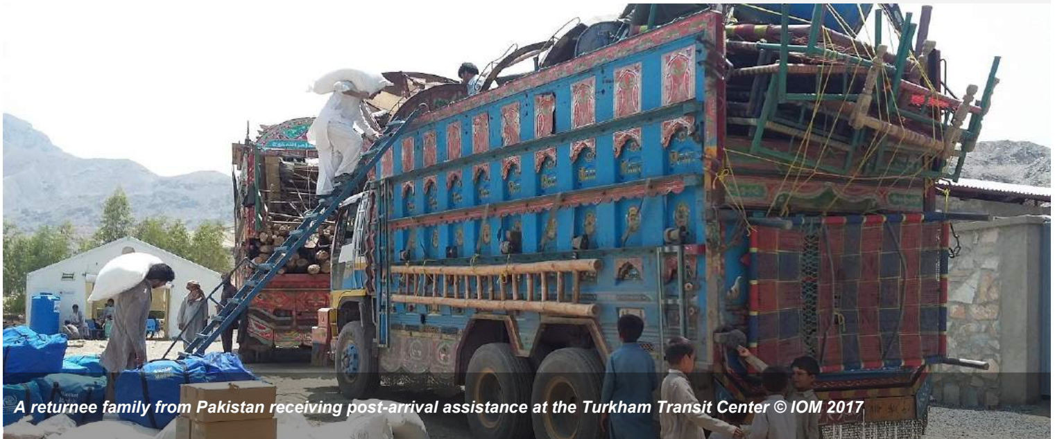
A returnee family from Pakistan receiving post-arrival assistance at the Turkham Transit Center

6% of returnees from Iran (524 individuals) assisted