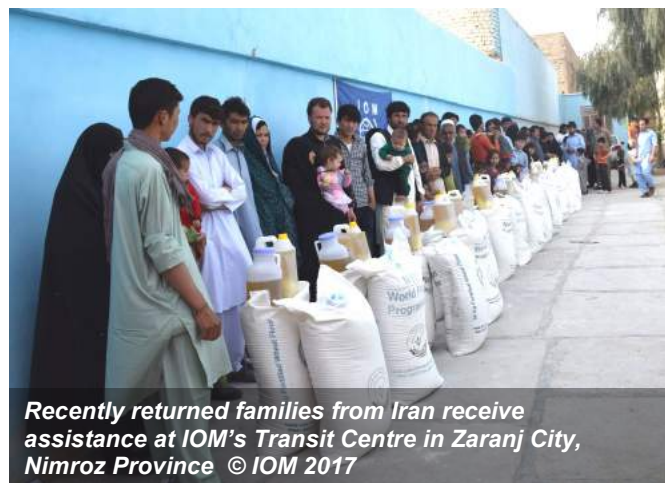
Recently returned families from Iran receive assistance at IOM's Transit Centre in Zaranj City, Nimroz Province

IOM provided post-arrival humanitarian assistance to 260 (6%) undocumented Afghans deported from Iran at its Transit Centers in Herat and Nimroz, including 50 special cases, 15 medical cases and 71 unaccompanied migrant children .