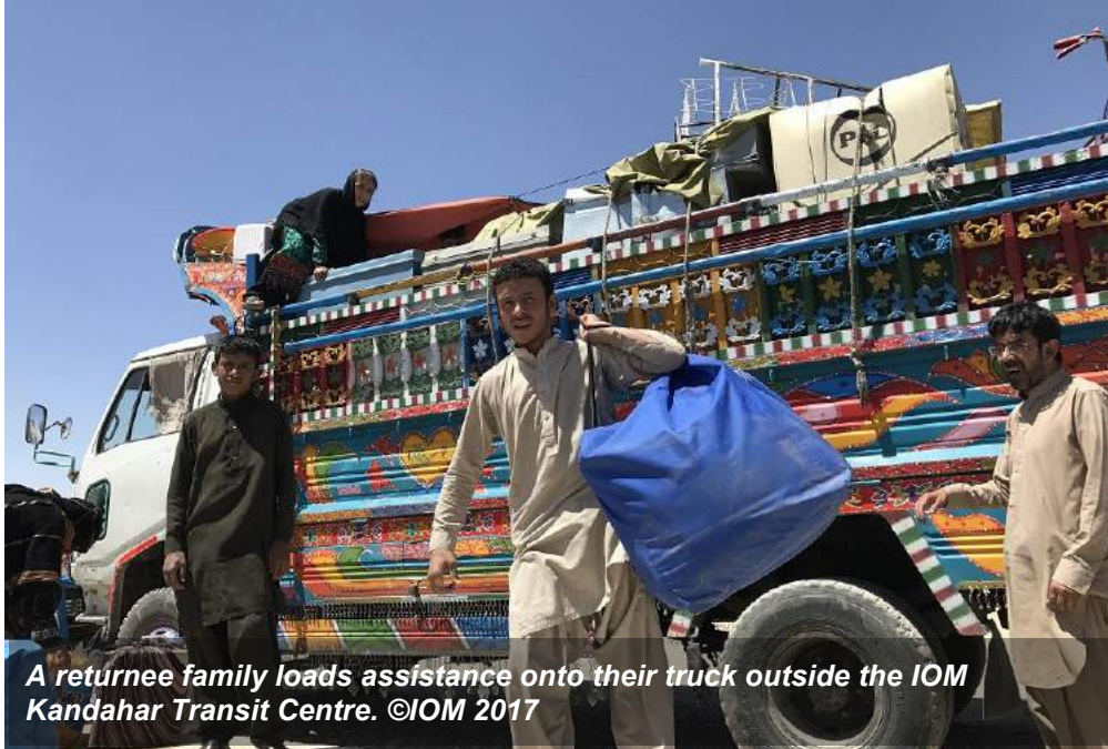
A returnee family loads assistance onto their truck outside the IOM Kandahar Transit Centre.