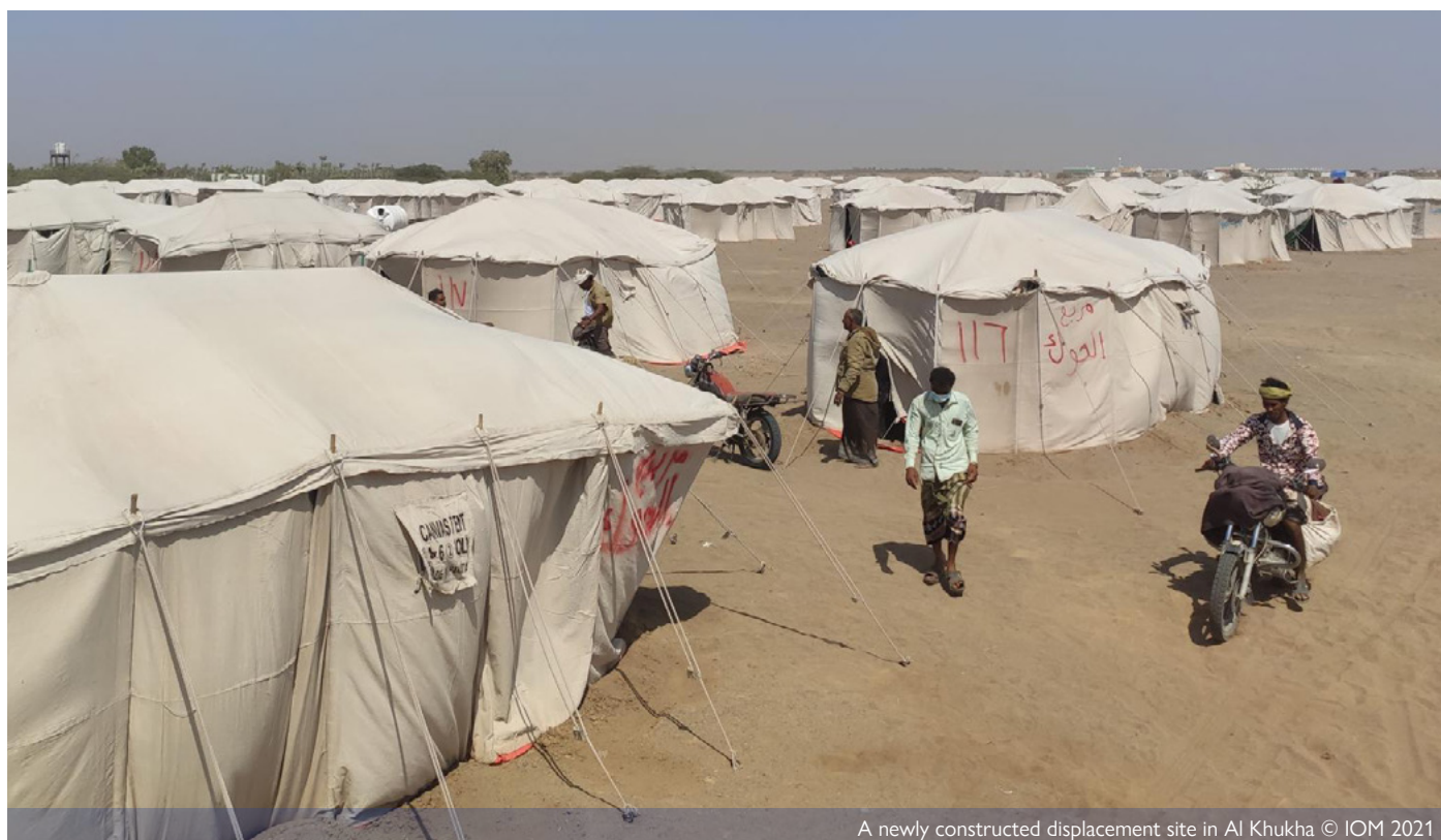
A newly constructed displacement site in Al Khukha

Following renewed hostilities on the west coast of Yemen, IOM's Displacement Tracking Matrix (DTM) estimates that more than 1,000 households (HHs) were displaced between 11 and 14 November 2021. The majority of internally displaced persons (IDPs) are reported to have fled to Al Khukhah district (895 HHs) followed by Al Makha (129 HHs).