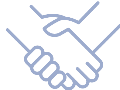
Any form of favour