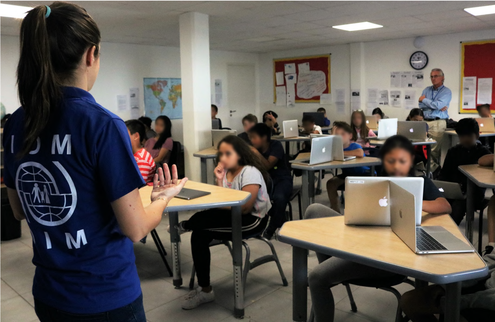
A sensitization session on Trafficking in Persons tailored to students of the American School of Antananarivo held in May 2019.

Lastly, IOM Madagascar supported and actively participated in the celebration of various International Days observed by the UN System, including International Migrants Day in December 2019, on the occasion of which IOM held the third edition in Madagascar of the Global Migration Film Festival (GMFF), with screenings of 8 movies and documentaries capturing the promises and challenges of migration accessible free of charge to the general public at the Photography Museum (“Musée de la photographie”) in Antananarivo.