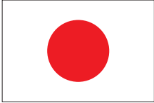
From the People of Japan