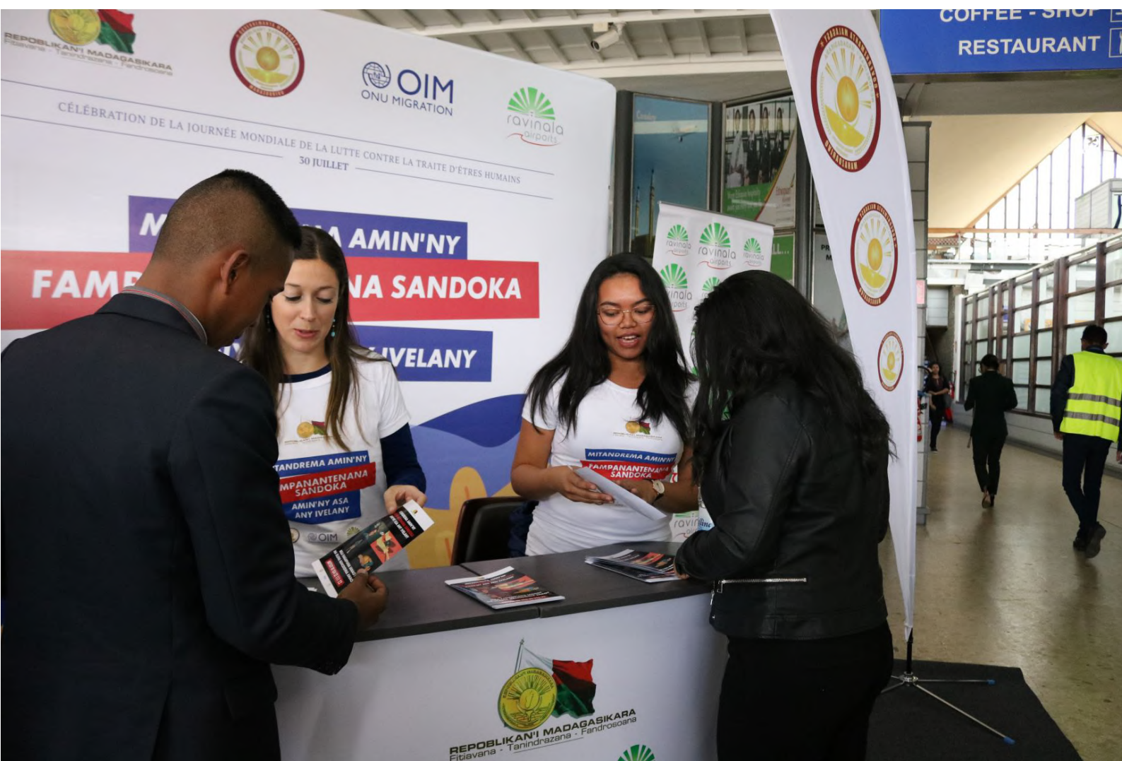
Launch of the awareness raising campaign on safe migration and risks of Trafficking in Persons at Ivato Airport on 30 July 2019.

IOM used various platforms and events to raise awareness and sensitize the public on the multifaceted realities of migration. In May 2019, IOM held a sensitization session on TiP targeting children aged 11 to 12 years, students at the American School of Antananarivo, with child-sensitive and adapted materials. Still in May 2019, IOM attended and co-sponsored the holding of the “Journées migrations rurales” (Rural migration day) together with FAO, the Institut de Recherche pour le Développement (IRD) and the Centre National de Recherche pour l’Environnement (CNRE), an academics and practitioners’ conference aimed at taking stock of the complex dynamics of internal migration and its effects in the country. In September 2019, IOM attended a multi-ministerial informal consultation on rural development, with migration chosen as the central topic of the monthly “Matinee du développement rural” animated by the Secrétariat Technique pour le Pilotage, la Coordination et l’Appui au Développement Durable (ST-PCADR). In October 2019, IOM sponsored the holding of the Third Urban Forum, a multi-day conference gathering local urban stakeholders such as