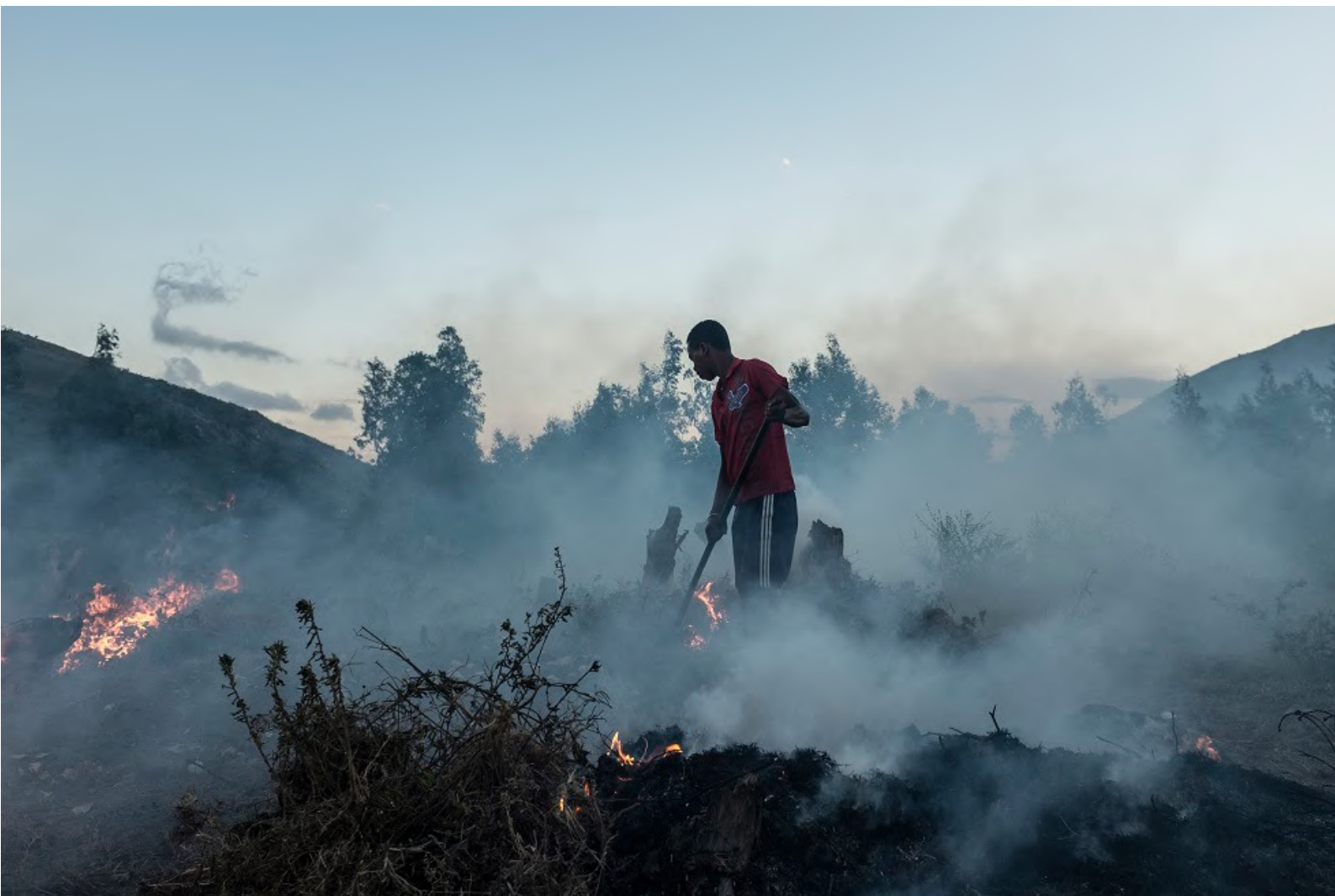
Slash and burn agriculture in Ambovombe in the Androy region, one of the regions most affected by environmental changes.

The health of migrants and other mobile populations should be closely monitored and promoted under public health strategies. The potential health hazards associated to migration are evident in the South Western Indian Ocean region. The Island States are currently experiencing an increase in migration trends which offers many benefits to businesses but also presents a unique set of challenges to sending and receiving states, as well as to migrants. Within the country, the severe plague outbreak experienced in the country from August to November 2017, with over 2,400 confirmed, probable and suspected cases of plague, and 209 deaths reported to the World Health Organization (WHO) demonstrated the close linkages between public health and human mobility, and the need of deliberate early action and preparedness intervention.