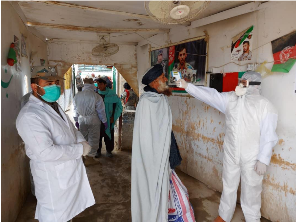
Temperature screening for incoming Afghans at the Chaman-Spin Boldak border in Kandahar with Pakistan on 08 April 2020. Over 70,000 stranded Afghan nationals returned to Afghanistan after a temporary border opening at Torkham and Spin Boldak from 06-09 April.