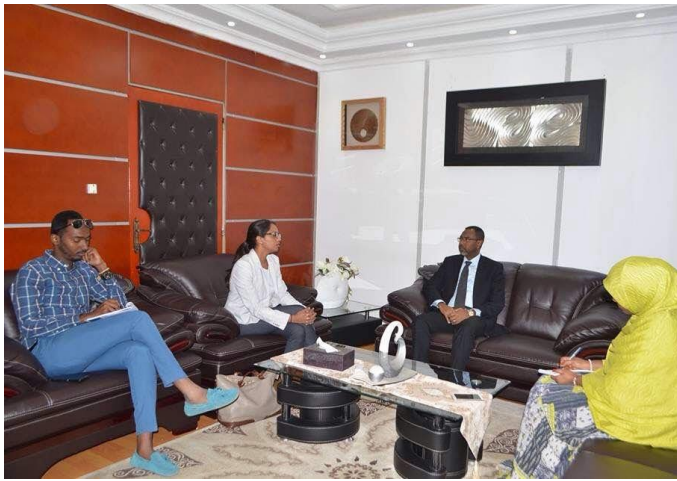
IOM Djibouti Chief of Mission meeting with the Minister of Labour in Djibouti