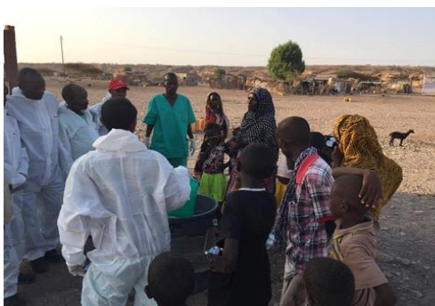
An awareness raising session in Fantaherou

Several awareness-raising activities in collaboration with the Ministry of Health were also conducted in the MRC in Obock as well as in the wider Obock region on AWD prevention.