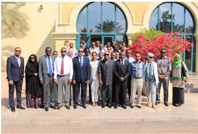
Participants of Diaspora Day @Hani / La Nation Djibouti 2017