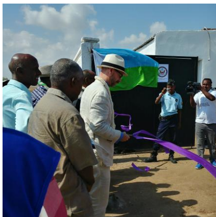
Representative from the United States cuts a ribbon to open the centre

The National Coast guard in collaboration with the Ministry of Equipment and Transportation and the support of IOM, opened a border post in the North of Djibouti, funded by the US Bureau of Population, Refugees, and Migration. The border post, inaugurated on December 17 th , 2017, allows the National Coast guard to monitor mixed migration flows in the region of Khor Angar and nearby cities in northern Djibouti.