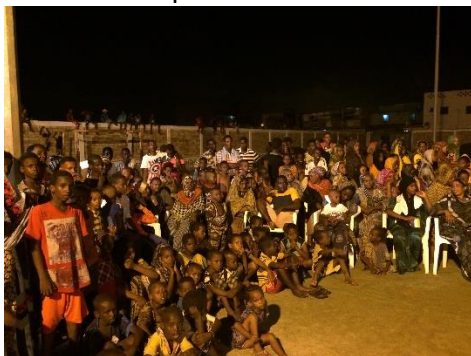
Participants of the evening

In the late evening, the IOM Chief of Mission, and UNFD members held discussions with the director of the CDC and local elected officials in the premises of the Arhiba CDC. They have mentioned the success of the event and the importance of continuing to circulate messages on irregular migration. It was found that the music sessions captured the attention of everyone, including the youngest. The strong presence of migrants in this neighbourhood and the interest of setting up a listening cell in the CDC were discussed.