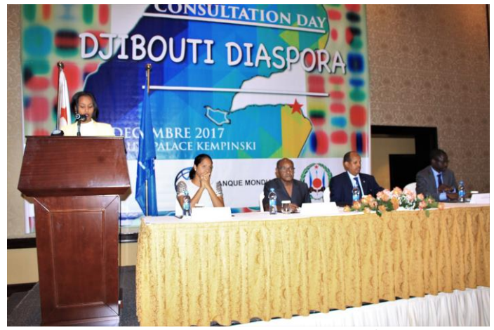
IOM staff speaking to the audience