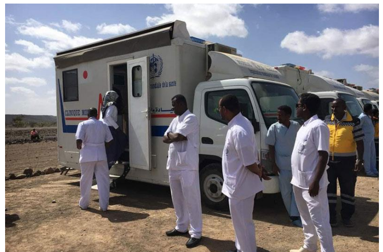
The Minister of Health in Djibouti and Doctors visit the mobile clinic