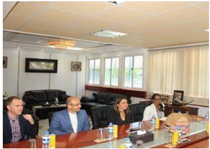
Representatives from the Canadian company Olymel in visit to Djibouti