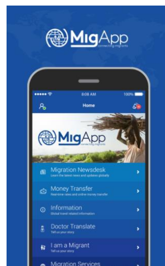
IOM's launch of MigApp on International Migrants Day, for more info

On November 12 th , a courtesy visit to discuss the effects of environmental change on migration flows took place between the IOM representative and the Minister of Housing, Urban Planning and Environment. During the meeting, IOM activities taking place in island states on climate change adaptation and strategic support to reduce the risk of disasters were discussed. Migration remains high on the international agenda on climate change, being very much present in the Sendai Framework for Disaster Risk Reduction 2015-2030, adopted at the Third UN World Conference in 2015. The "Enquete zéro bidonville" was also discussed, as a large migrant population may be living in these areas.