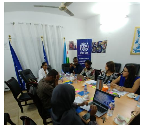
Program staff from IOM Djibouti and Burundi participate in the training