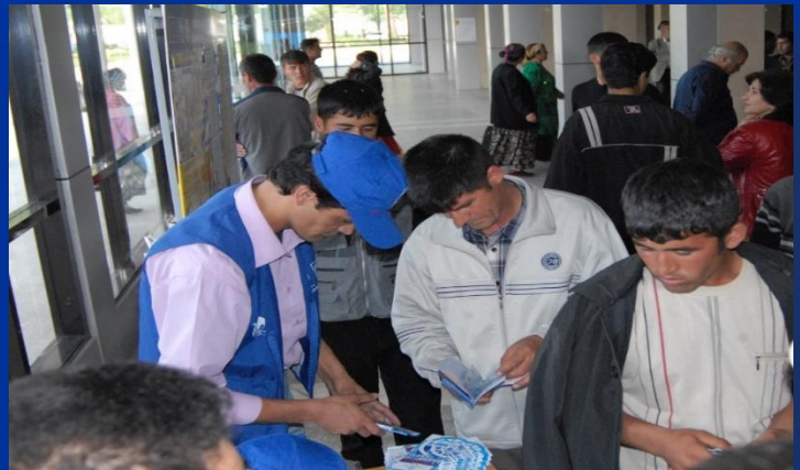
IOM Tajikistan HIV outreach to migrants in 2011. This photo has been used for the official website at the head of the article addressing the regional dialogue on 12 November 2020.

On 12 November, IOM, WHO, Tajik health authorities, and the NGO AFEW held a regional dialogue titled "Migrants' Access to Essential HIV Services: Progress and Opportunities amid COVID-19". At the event, IOM claimed that the lack of cross border cooperation between sending and receiving countries is making migrants with HIV more vulnerable. The dialogue resulted in recommendations to address the challenges raised and extend best practices developed by policy makers and frontline organizations.