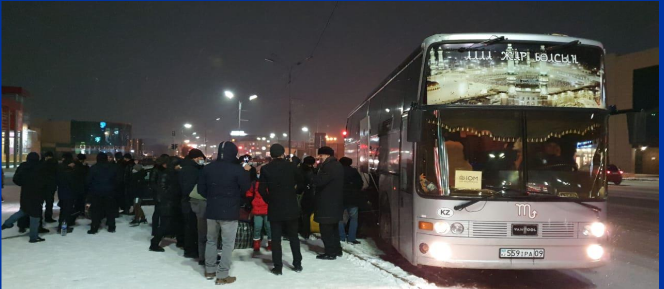
During the reporting period IOM Kazakhstan, IOM Tajikistan, and IOM Uzbekistan in cooperation with the Governments, NGOs and Diaspora representatives facilitate voluntary return of 3120 stranded vulnerable migrants back to Tajikistan by land through the territory of Uzbekistan.

COVID-19 in Central Asia (Kazakhstan, Kyrgyzstan, Tajikistan and Uzbekistan): 330, 528 registered cases, 4,378 deaths.