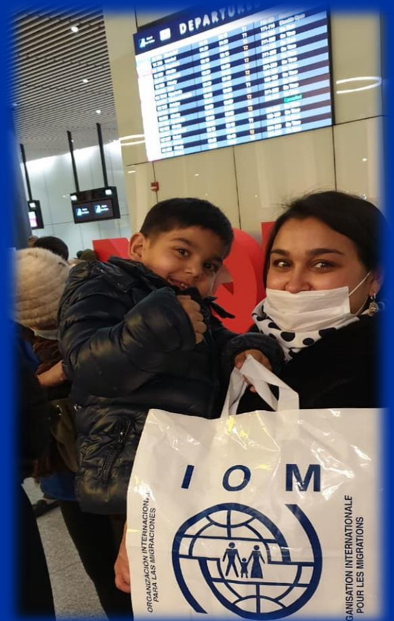
In November 2020 18 vulnerable migrants received assistance for their voluntary return from Kazakhstan to Moldova.

IOM missions in Central Asia have assisted 7,801 victims of trafficking and vulnerable migrants.