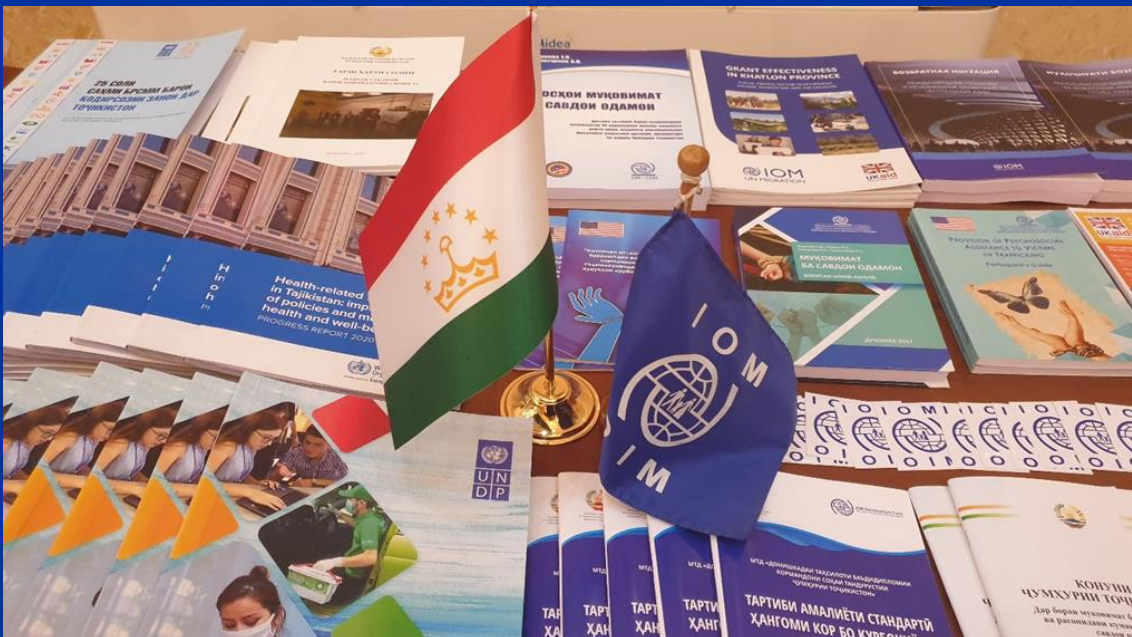
Exhibition table of IOM Tajikistan during «UN Reform Dialogue: United Nations and the Government of Tajikistan»