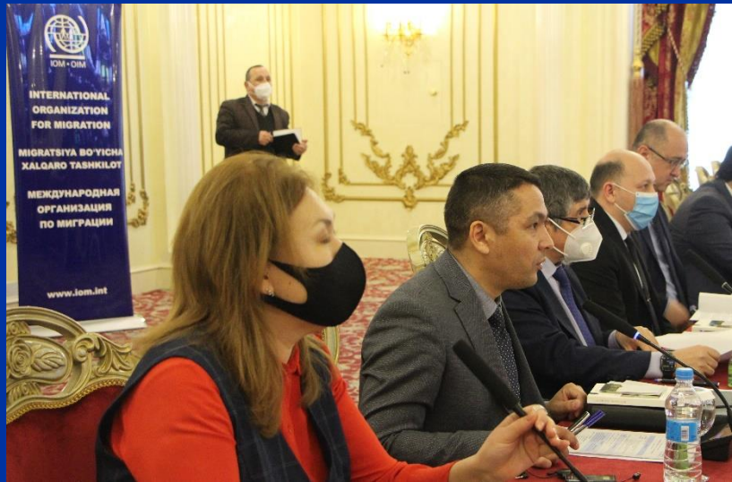
March 18, 2021, Tashkent, Uzbekistan

The events gathered experts and officials from IOM, international organizations, and