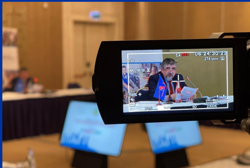
March 31, 2021, Nur-Sultan, Kazakhstan

to exchange the experience in collection, analysis and reporting the data on displacement and mobility of the population in the region.