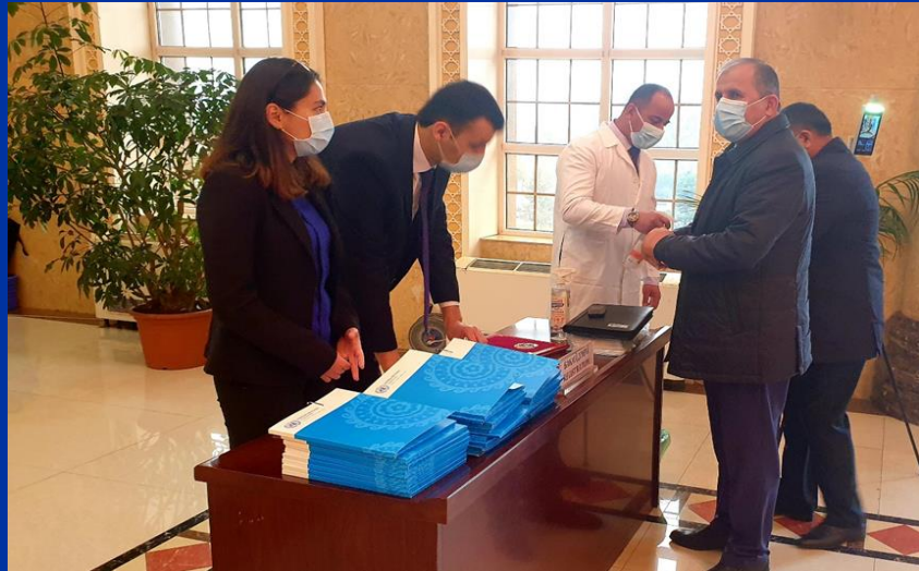
Participants of “UN Reform Dialogue: United Nations and the Government of Tajikistan” going through the body temperature check and registration

On 11 March, ‘UN Reform Dialogue: United Nations and the Government of Tajikistan’ took place at the premises of the Ministry of Foreign Affairs of Tajikistan. IOM Tajikistan, together with other UN agencies, organized an exhibition to share