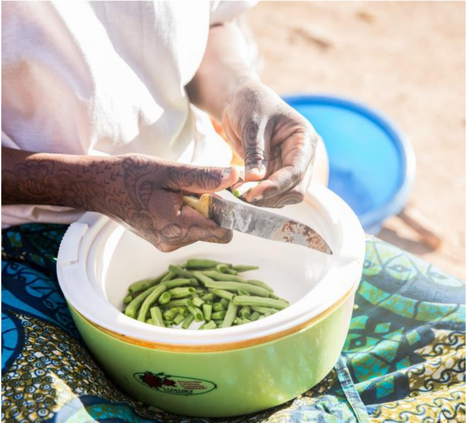
Female returnee in Niger