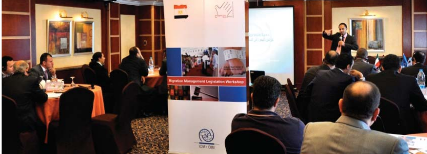
JORDANIAN DOCUMENT FRAUD PRACTITIONNER (ABOVE) - MIGRATION LEGISLATION WORKSHOP HELD IN CAIRO IN 2009 (BELOW).