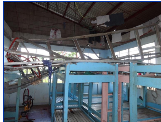
Damaged bedroom ceiling of Boy's Shelter

Managed by the local government, Tagguro Boys' Shelter provides a safe haven for out-of-school boys who are neglected, abandoned or abused and do not have guardians to look after them. Before Typhoon Haiyan, 36 boys between 10 to 18 years of age, were living and playing together in the shelter. With the typhoon destroying a large part of the building, the majority of the boys had to leave the shelter and seek refuge elsewhere. The rest decided to stay in the remaining part of the building, although many of the facilities including the kitchen, the roof and the ceiling were severely damaged.