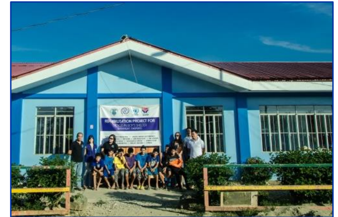
Repaired and refurbished Boys' Shelter

Upon the request of the City Government and the UN Protection Cluster and with generous donations from private donors, IOM carried out repair and refurbishment of the Boys' Shelter including the roofing, ceiling, replacement of windows and door panels, masonry works and kitchen canopy extension, repainting, drilling and installation of a hand pump. All the repair work was assisted by Cash-for-Work workers, who had lost their jobs due to the typhoon. They also benefited from this project and received a temporary source of income towards their livelihood costs.