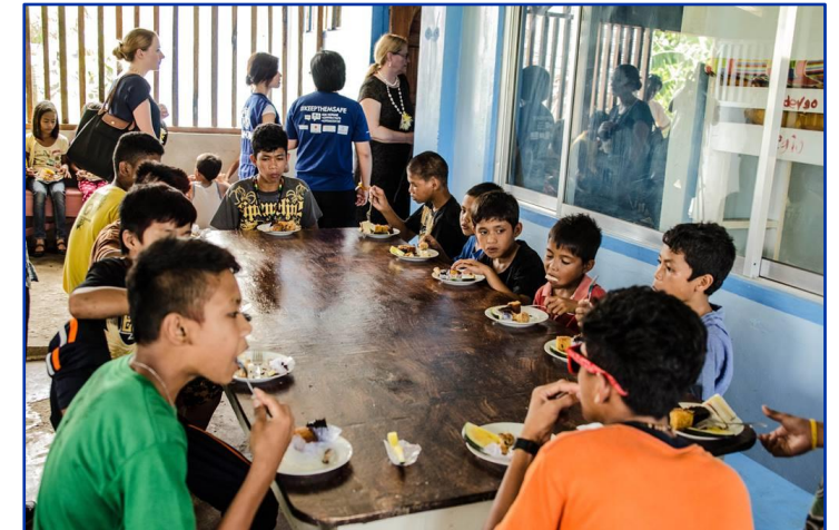
Boys back in the shelter enjoying their first meal together

For more information about this project, please visit: http://www.iom.int/files/live/sites/iom/files/Country/docs/Tagguro-Boys-Shelter-progress-report_140923.pdf